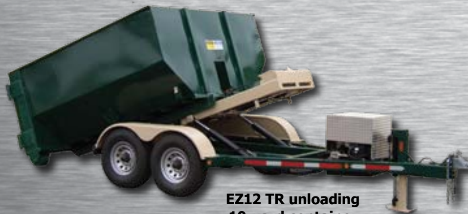
EZ12 TR unloading 10-yard container

We also manufacture high-quality mini-rolloff trailer systems to fit your needs. Contact us for more information.