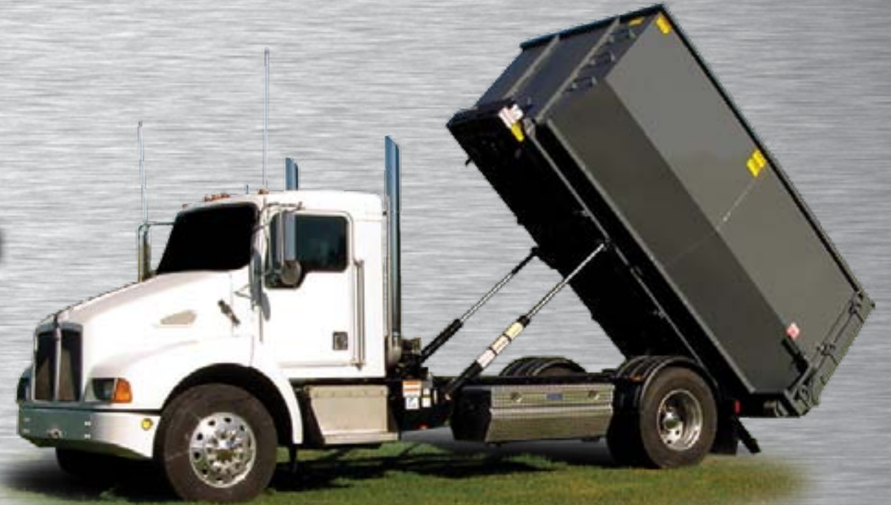
EZ20 TH shown at full dump angle (51°)

Compatible with 6, 8, 10, 15, 20 and 30 cubic yard dump containers!