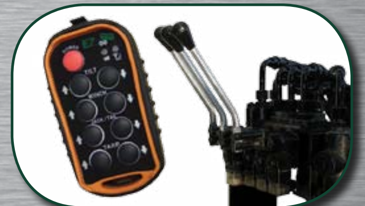
Wireless remote & manual controls (standard on all hoists)

Control your project. Increase your efficiencies. Improve your bottom line. EZrolloff. It just makes sense.