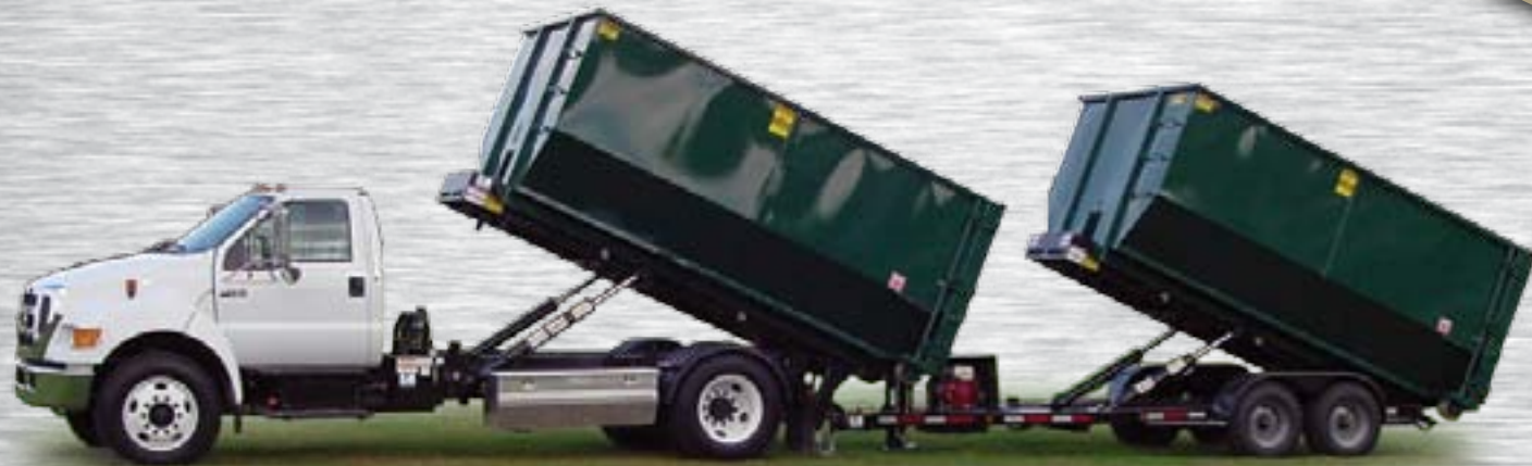
EZ20 TH Truck Hoist and EZ16 TR Trailer with 20-yard containers