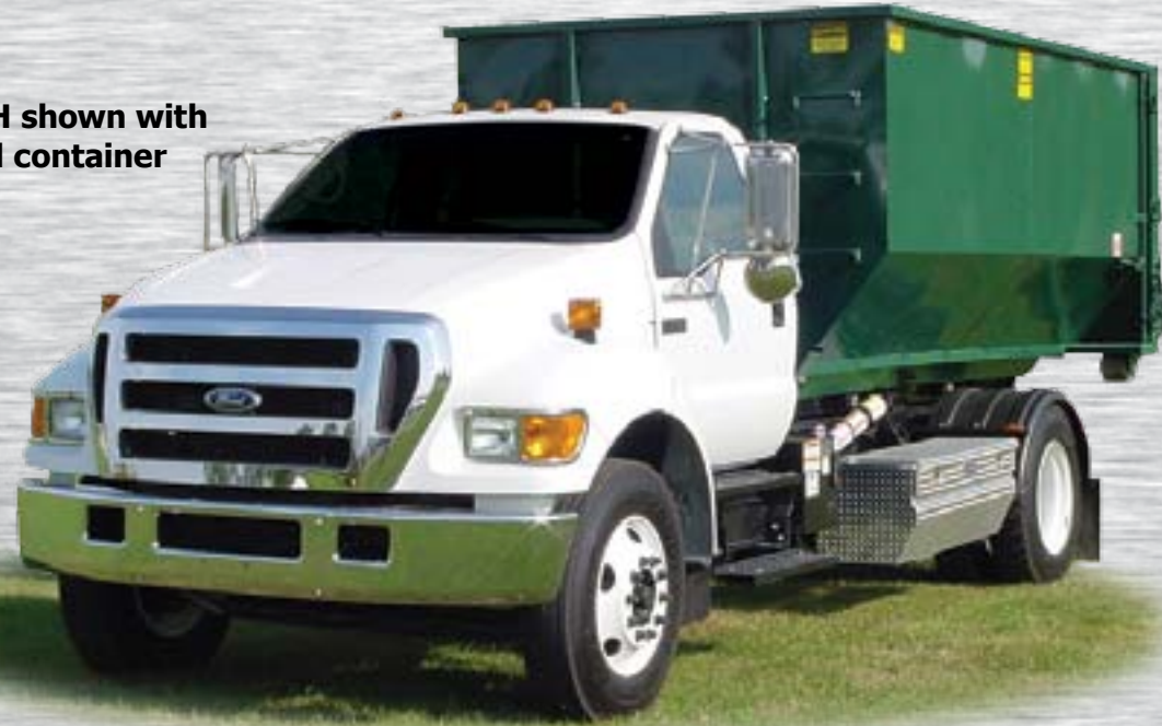
EZ20 TH shown with 20-yard container

Multiple rolloff accessories can make this truck hoist an even more versatile addition to your business.