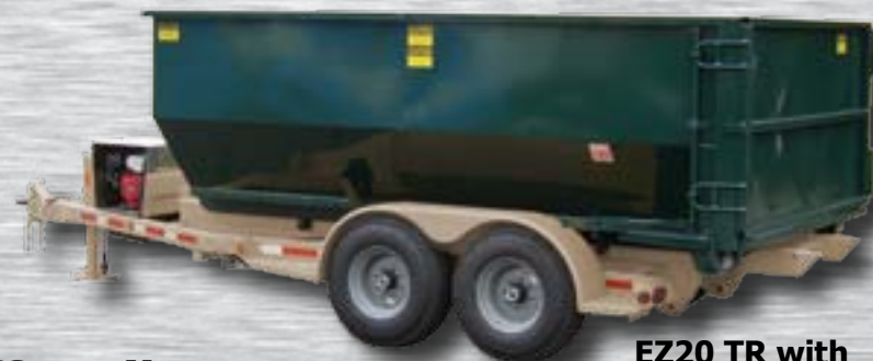
EZ20 TR with 15-yard container

EZ6C (6 yard) EZ8C (8 yard) EZ10C (10 yard) EZ15C (15 yard) EZ20 (20 yard) EZ25 (25 Yard)