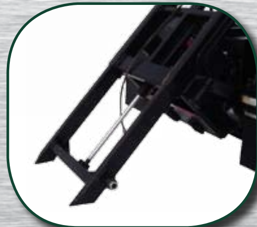
Hydraulic extendable tail (standard on all hoists)

EZrolloff systems let you work in tight quarters. Our truck hoist systems need less space and offer much greater flexibility than a traditional large truck hoist. Makes any hauling or waste removal job easy, regardless of the surroundings.