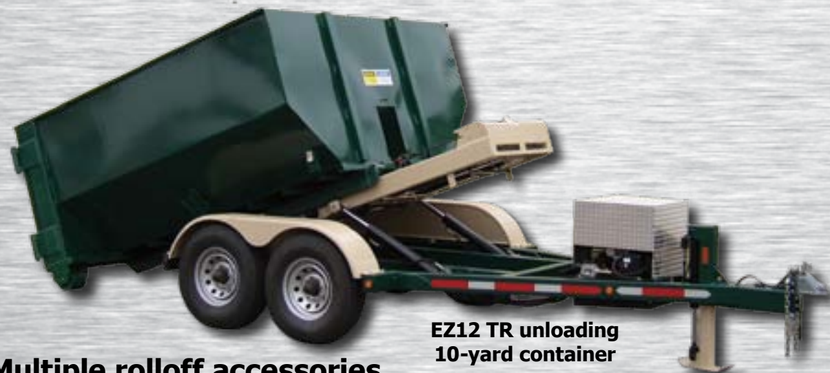
EZ12 TR unloading 10-yard container

Compatible with 6, 8 and 10 cubic yard dump containers!