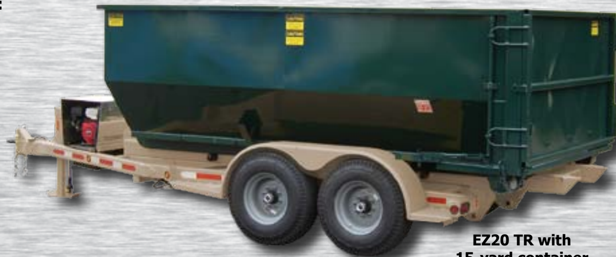
EZ20 TR with 15-yard container