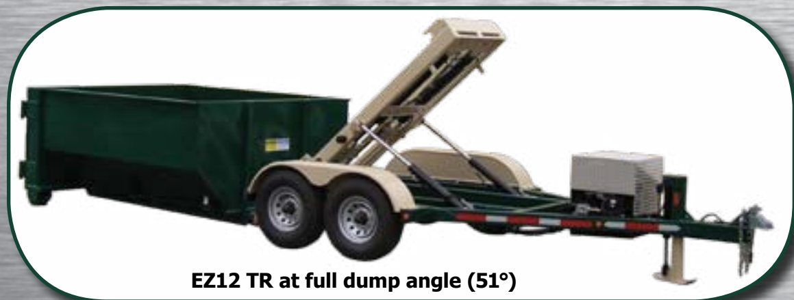
EZ12 TR at full dump angle (51°)

Highest Quality Mini-rolloff trailer system in the industry!