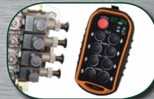
Wireless remote & manual controls (standard on all trailers)

Control your project. Increase your efficiencies. Improve your bottom line. EZrolloff. It just makes sense.