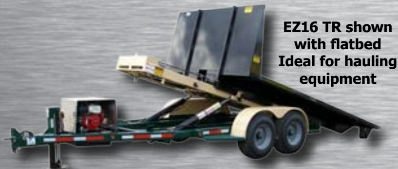
EZ16 TR shown with flatbed Ideal for hauling equipment

Our line of rolloff accessories can make the EZroll-off trailer system an even more versatile tool. Customers can haul their equipment, set up on-site storage and even use mobile fuel tanks. Please call us for more information or specifications.