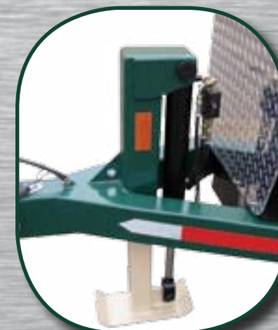
Hydraulic jack (standard on all trailers)