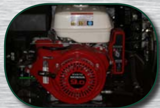
9 HP Honda Engine (12 TR), 13 HP (16 & 20 TR) & wireless remote control (standard on all trailers)