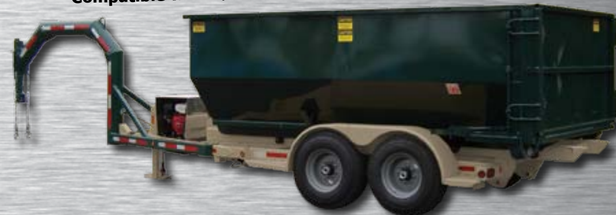
EZ16 TR shown with detachable gooseneck option and 15 yard commercial container

Compatible with 6, 8, 10, 15 and 20 cubic yard dump containers!