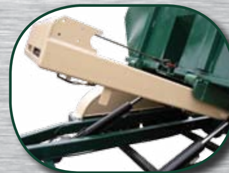
Reliable cable-pull system and locking bar for increased safety (standard on all trailers)